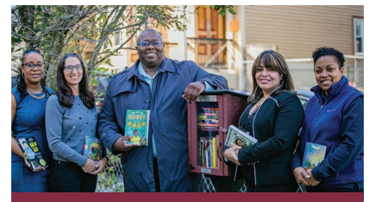
PARTNERS FROM ABCD PARKER HILL, STORYTIME CRAFTS AND NEEDHAM BANK AT THE LITTLE LIBRARY INSTALLATION.

employees facilitated workshops with Junior Achievement and provided mentorship to Boston Public School students through support of BUILD Greater Boston. Residential Lenders also shared their expertise at several First-Time Homebuyer workshops offered in partnership with organizations like the Massachusetts Affordable Housing Alliance and the Asian Community Development Corporation. Our community commitment goes well beyond just writing checks. Our team is eager to volunteer and make a difference.