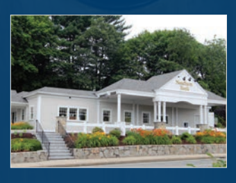
Westwood 341 Washington Street Westwood, MA 02090